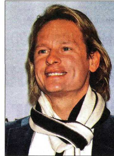
VILIFIED: Carson Kressley.